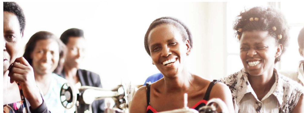
Left: Vocational Training student at Abasangiye Cooperative Above: members of Abasangiye Cooperative

Where does this all lead? A debilitating 63% youth underemployment rate throughout the country.