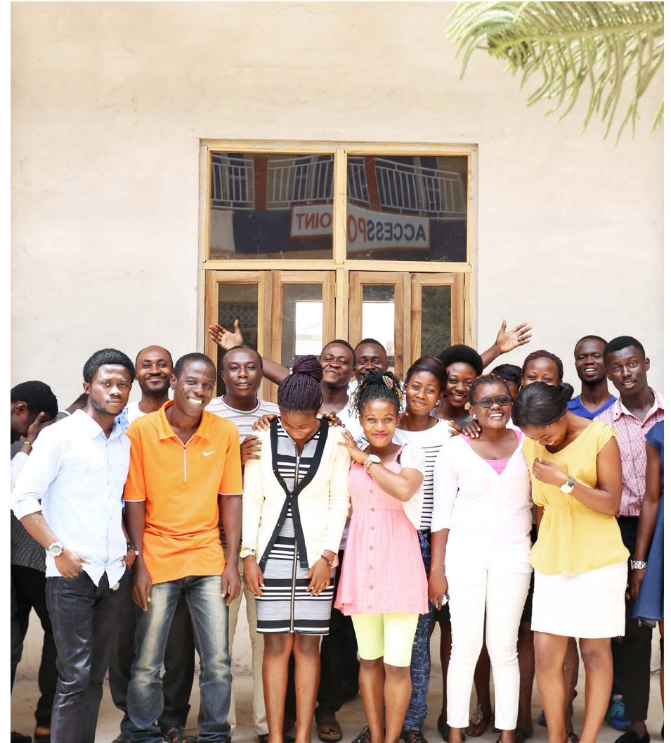
Left: Three students at our Basic Business Training program in Ghana Above: Indego Africa's first youth Basic Business Training class in Kumasi, Ghana