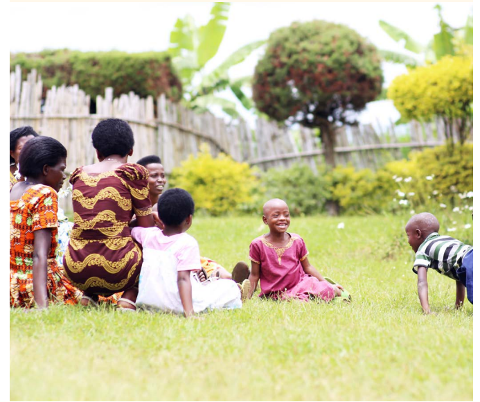
Mothers from Ibaba Cooperative

In May 2016, we launched our first-ever Mothers' Month—a month-long campaign to honor the incredible mamas who handcraft our products.