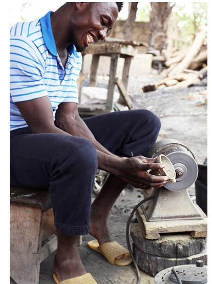
Artisanal skills in Ghana From left to right: batik being laid to dry; a kente loom; block printing; bolga grass for weaving; recycled brass shaping