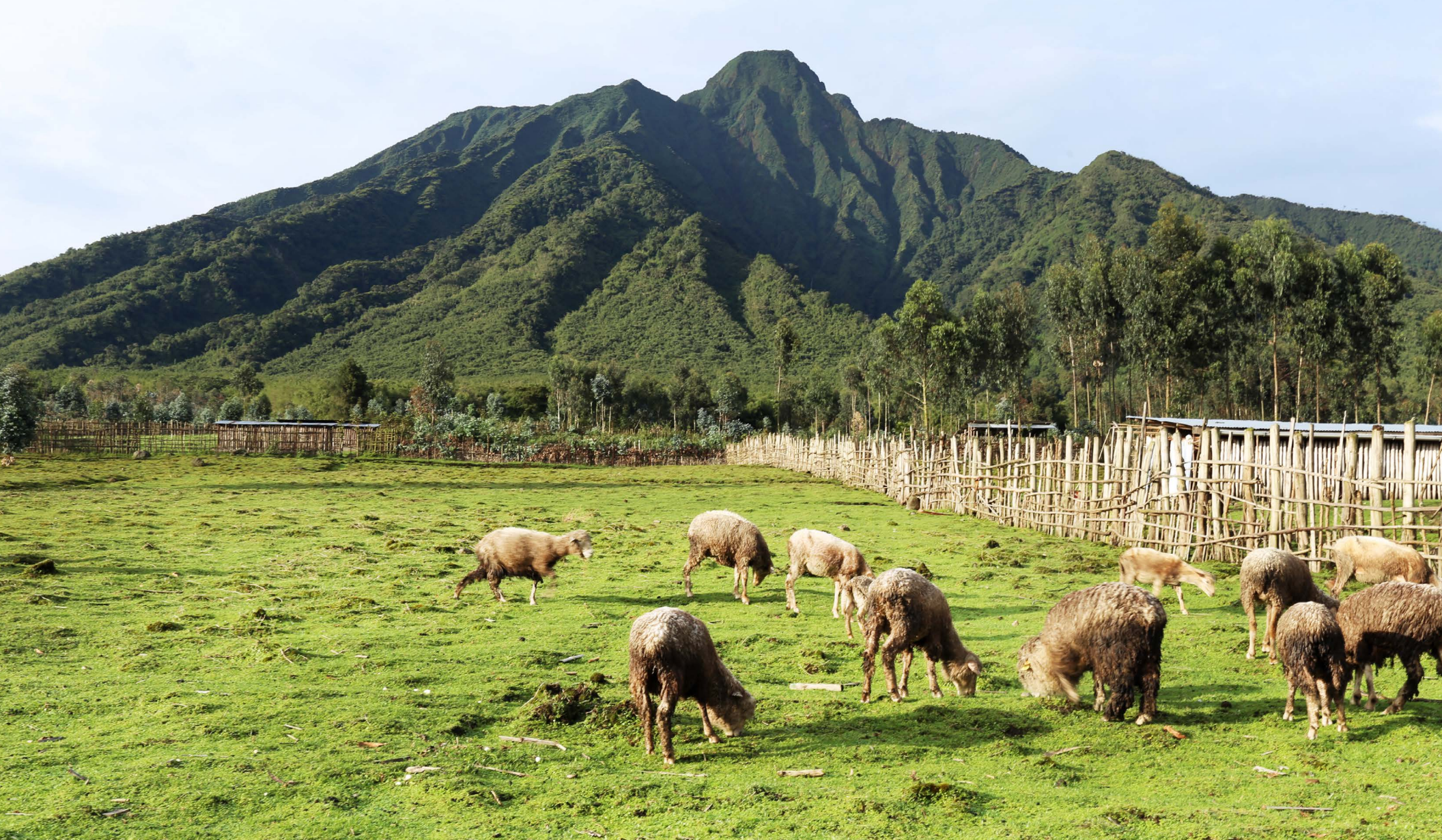
Merino sheep in Musanze, Rwanda