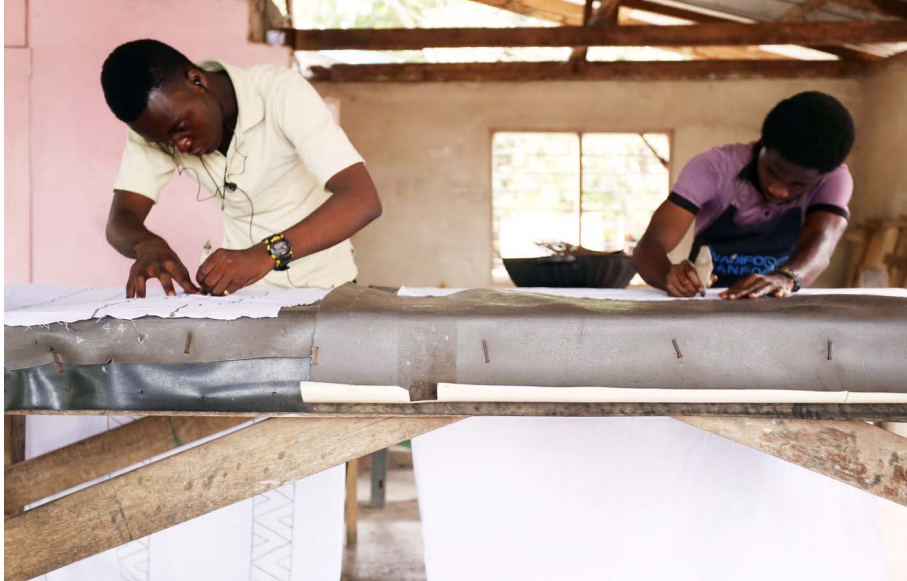
Artisans practicing block printing using wax

We conducted extensive research on ten different African countries, considering a wide range of factors such as infrastructure, governance, levels of corruption, human rights, logistics, pre-existing artisan activity and, most importantly, social impact needs.