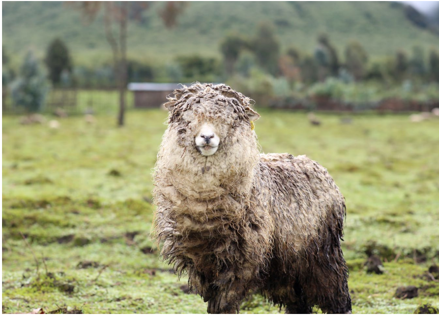
Merino sheep on the Handspun Hope Farm, Musanze, Rwanda

At the base of Rwanda's majestic Virunga Mountains, nestled among lofty trees and serene expanses of green, is a farm. It is a picturesque pastoral scene, amidst breathtaking East African beauty. A shepherd walks the fields caring for a flock of sheep, with Virunga's misty volcanic mountains rising in the backdrop.