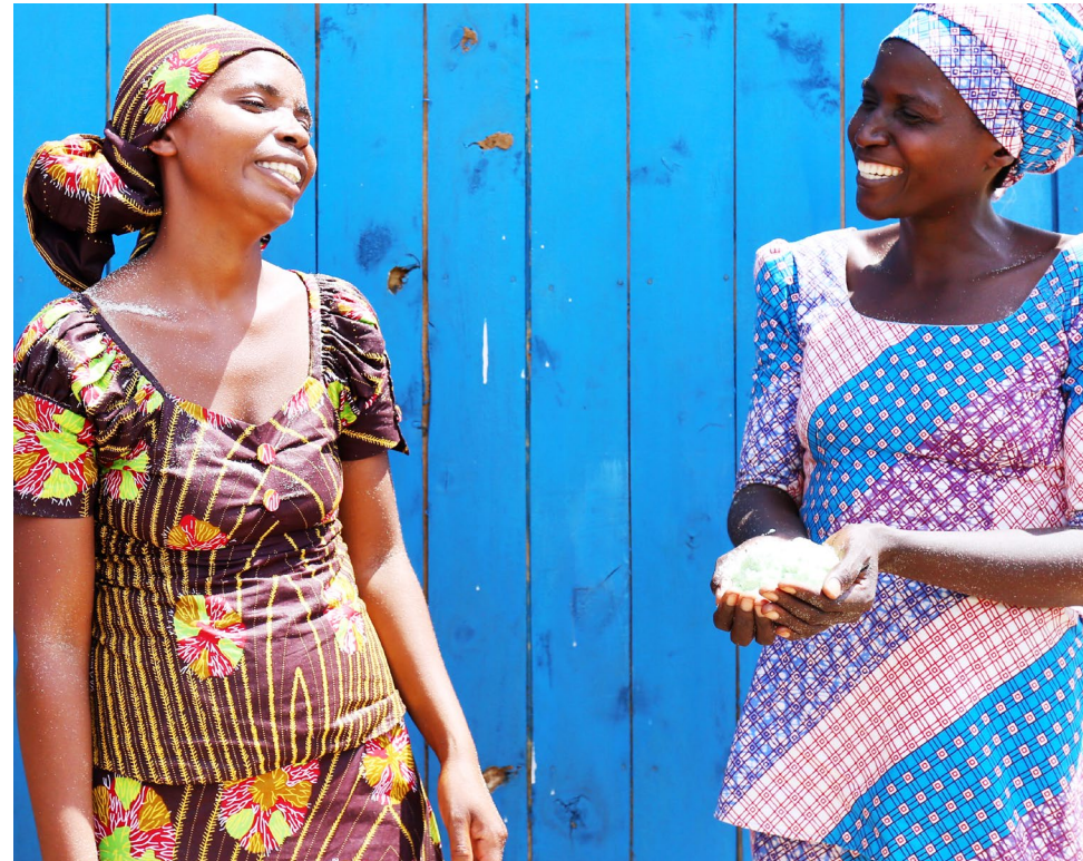
Live Colorfully (pg. 25)

" INDEGO AFRICA IS A HAPPY ORGANIZATION BECAUSE IT HELPS WOMEN BECOME CONFIDENT AND INDEPENDENT "