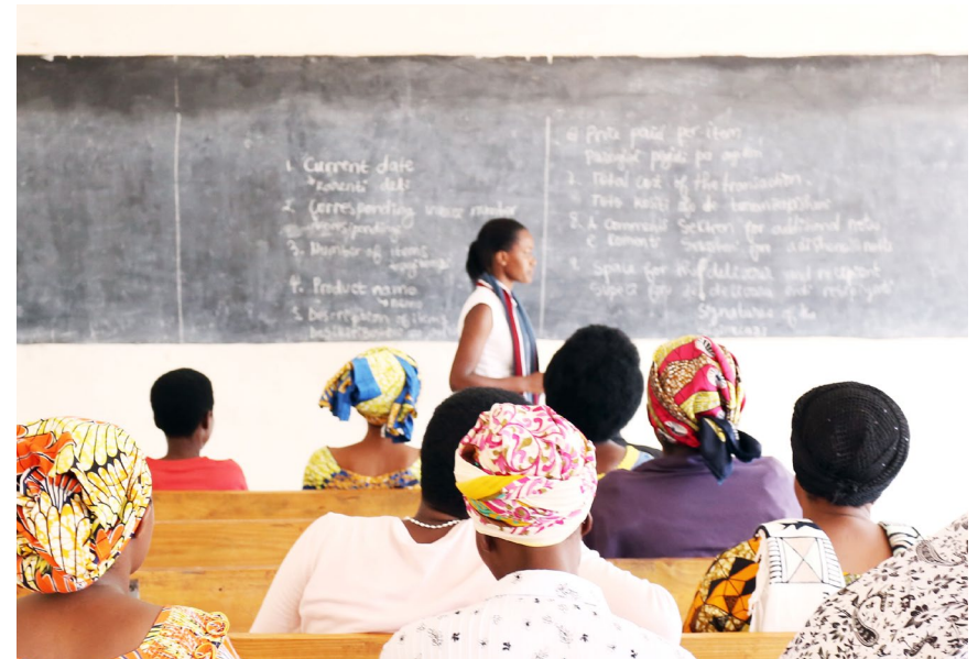
Training classroom in Rwanda