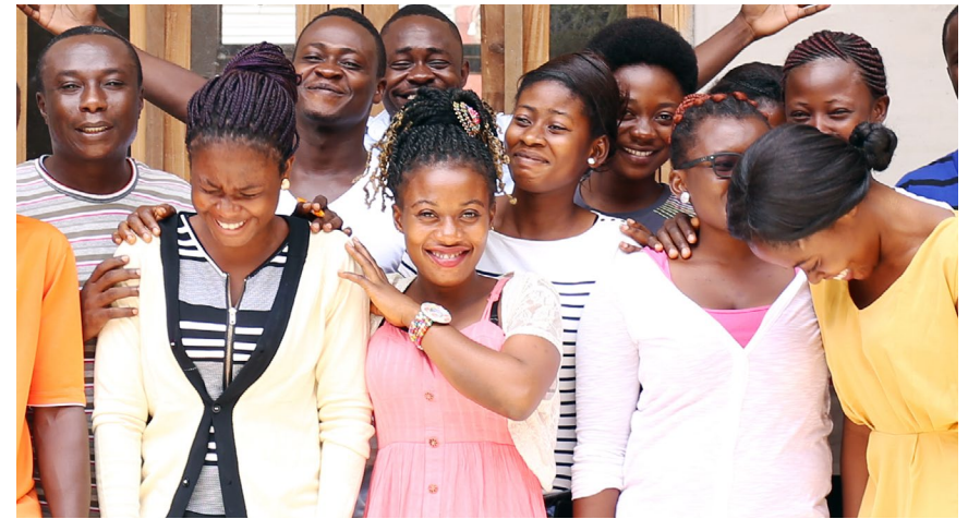
Technology training students in Ghana

As technology spreads across the globe, it brings with it possibilities of innovation, economic growth, inclusion, and better quality of life.