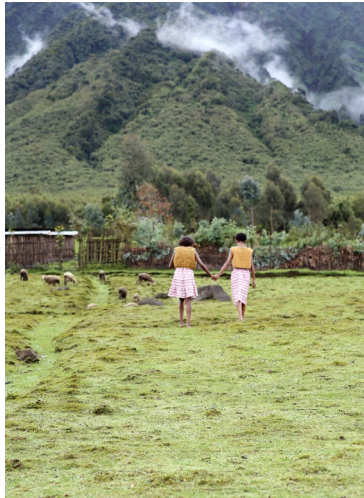
Handspun Hope Farm, Musanze, Rwanda

Musanze, Rwanda is a rural, agrarian community where many people, especially women, live in extreme poverty, struggling day to day with hardships including hunger, illiteracy, lingering psychological trauma, and HIV/AIDS. Women are eager for opportunities to break out of this cycle of poverty—for opportunities to work, to support themselves and their families, and to contribute to the growth of their country.